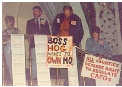
In 1996, MRCC members presented 20,000 petition signatures to the legislature demanding local control, clean water and clean air. That year we passed the first ever CAFO standards.