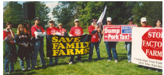
In 2001, MRCC members organized to stop factory farm expansion in Missouri and end the Pork Checkoff—"Save Family Farms", Dump the Pork Tax" & "Stop Factory Farms"!