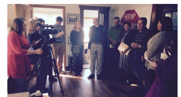
Media turns out for “Stop Factory Farms” press conference at MRCC office.