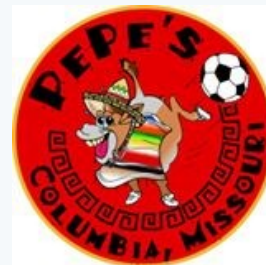
Pepe's Taco Truck serves great tacos with Patchwork Family farms pork!

If you're in Columbia & need a quick bite for lunch, dinner or late night, check out Pepe's & Ozark Biscuit Co.!