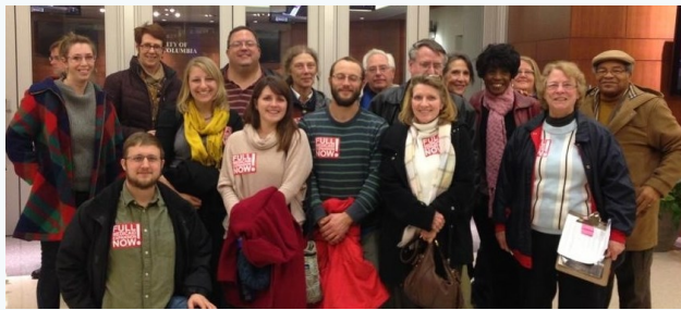
MRCC organizes support for a Medicaid Expansion Resolution at the Columbia, MO City Council Meeting. The Council approved the Resolution.

closing due to our legislature's refusal to expand Medicaid. Check out these troubling developments: