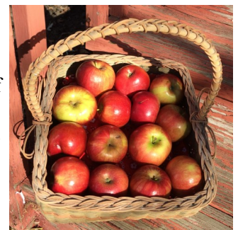
Food co-ops receive in-season, local produce like these apples from Waverly, MO.