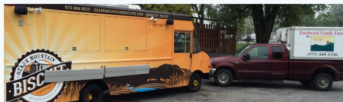
Patchwork Family Farms and Ozark Mountain Biscuit Co., sittin' in a tree...