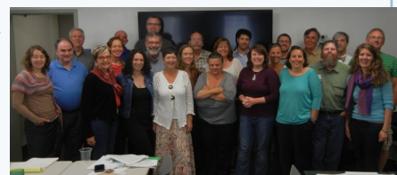
MRCC and Allies Meet in D.C. to talk about how current "free trade" affects family farms.

This type of trade agreement dramatically increases the profits of huge agribusiness corporations at the expense of U.S. farmers, rural economies & consumers."